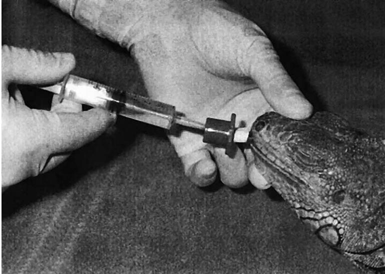
Fig. 1. Tracheal wash in an anesthetized green iguana ( Iguana iguana ) with pneumonia.

midity, inadequate diet, and chronic stress will predispose the reptile to the development of infectious diseases, including respiratory disease. A detailed history, including information on husbandry practices, hygiene procedures, and onset and progression of clinical signs should be obtained. In large reptile collections, the quarantine program, if present, should be evaluated.