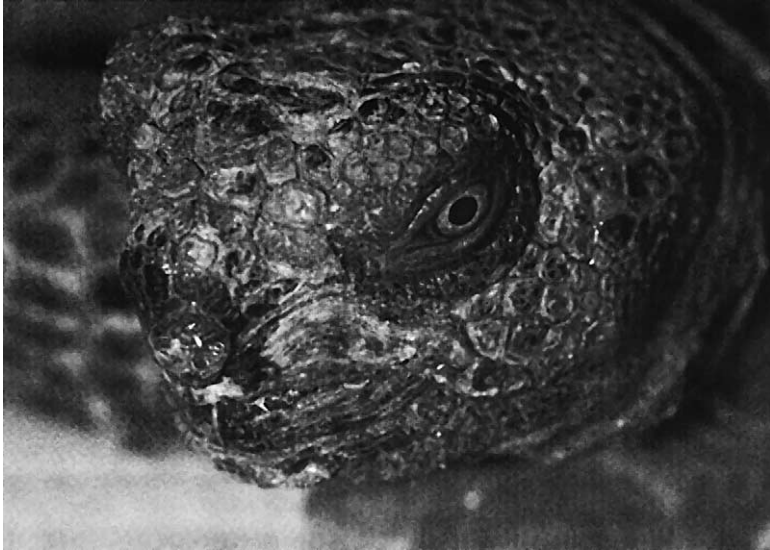
Fig. 3. California desert tortoise ( Gopherus agassizii ) with chronic upper respiratory tract disease (URTD) caused by Mycoplasma agassizii .

sick reptiles, but in most cases they appear to be secondary invaders following bacterial infections. Improper husbandry practices such as too high or too low environmental temperature, high humidity levels within the enclosure and chronic stress will promote growth of fungal organisms. Chelonians appear to be more susceptible to fungal infections than other orders of reptiles and Candida spp., Aspergillus spp., and Penicillium spp. have been isolated from chelonians with respiratory disease [5]. Collection of diagnostic specimen for the diagnosis of fungal pneumonia include tracheal washes, submitted for cytology and culture, as well as endoscopy and visualization of the respiratory tract including collection of biopsies and specimen for culture.