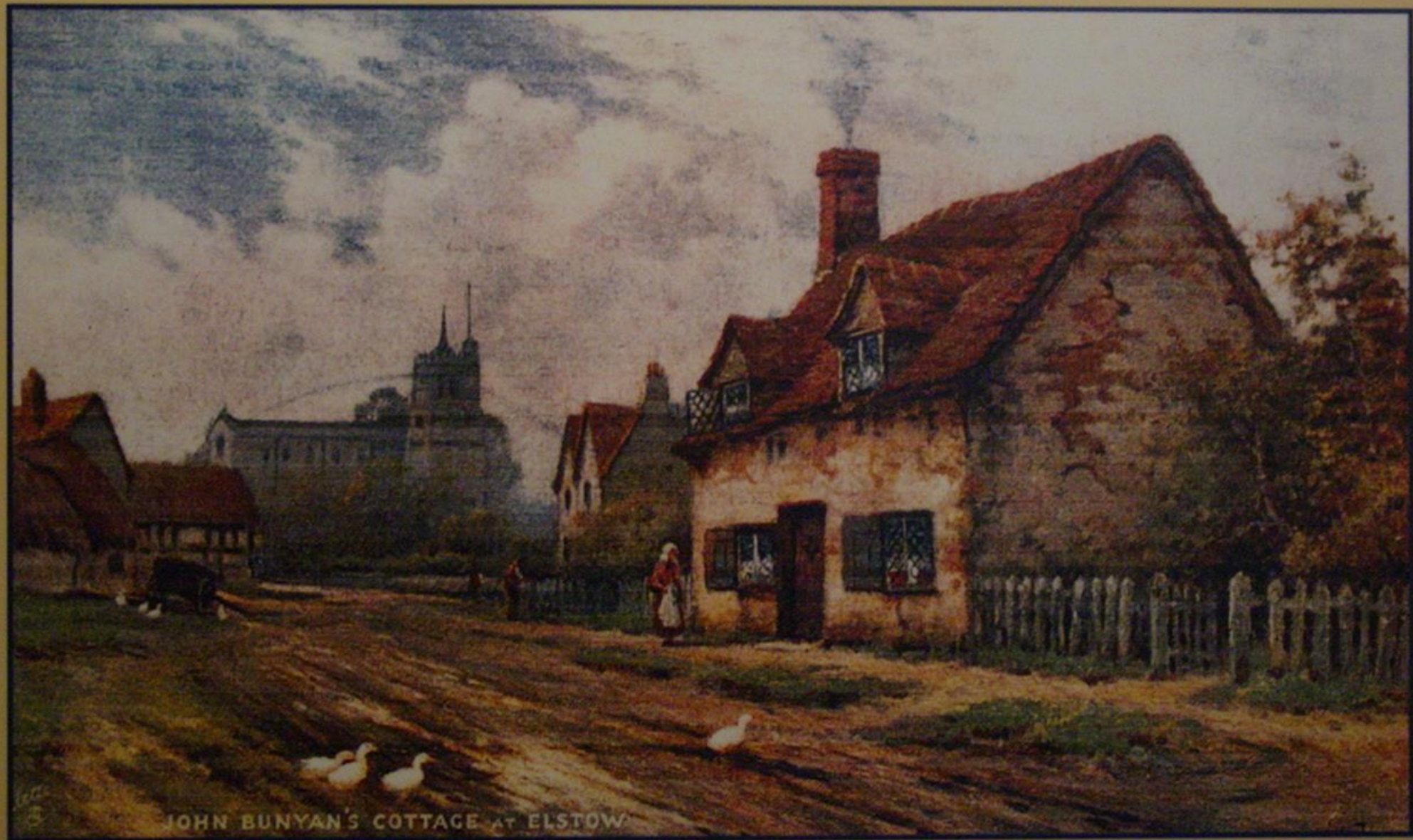
JOHN BUNYAN'S COTTAGE AT ELSTOW

The cottage at Elstow. Bunyan lived here after his marriage