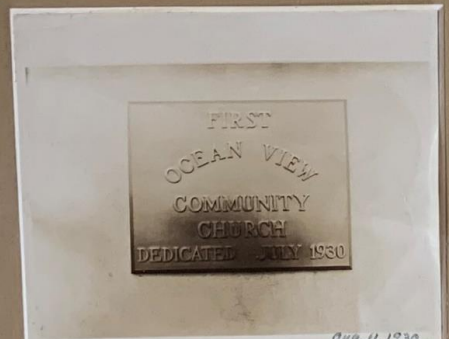
Aug. 11, 1930