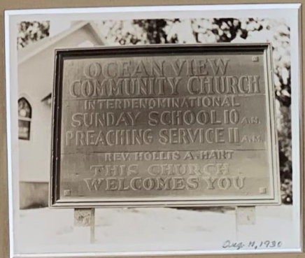
Aug. 4, 1930