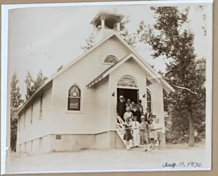
Aug. 11, 1930