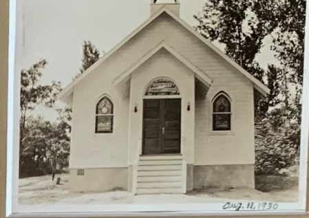
Aug. 11, 1930