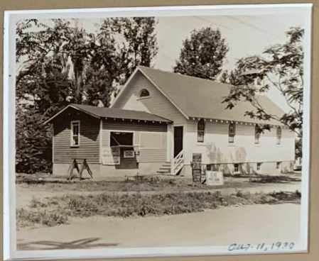
Aug. 11, 1930