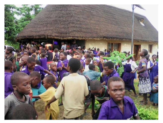
Young brains excited about the Library

The ceremony started at 2:00 p.m. with a tour of Sam's Village to make the guests appreciate the context in within which M'teza Library was built. Though very heavy rains poured half way through the function, the launch was still a success.