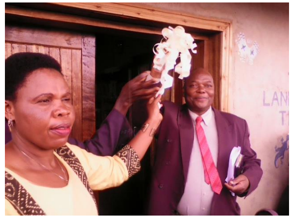
On February 1st, 2017 the doors of M'teza