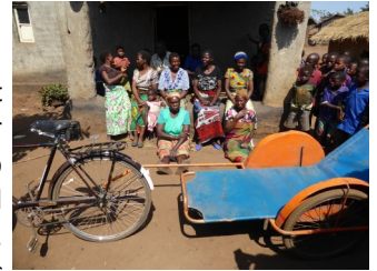
Chibwata BA committee