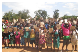
Chitsime School receiving exercise books