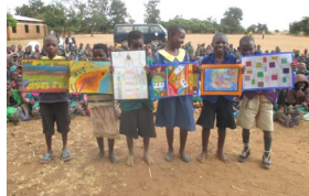
Displaying some art work from The Mall Prep School