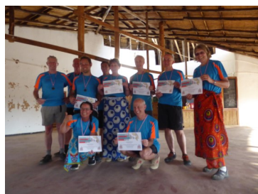
The cycle team with their certificates.