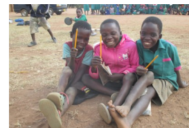
Chitsime School excited to receive pencils!