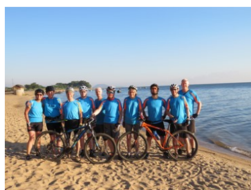
(above) The team at Mangochi

9 cyclists set off for a 500km challenge in May and raised a staggering £13,000! They started in Blantyre and travelled up to Zomba, Liwonde, Mangochi, Salima and ended at Sam's Village. The cycle was memorable and an incredible way to see Malawi. It included a safari and day off by Lake Malawi. There is a talk about the trip on 8th July from 6:30pm at St Matthew's Church. There will be another cycle challenge next Easter if anyone is interested, please contact our team.