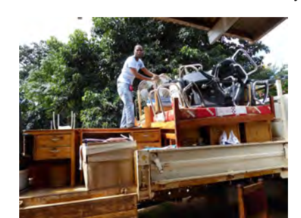
On the move