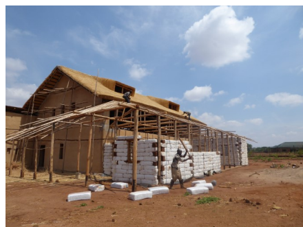
Adobe (earth bag) meeting areas