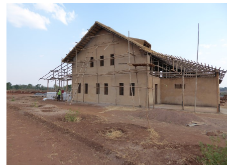
Front of new office