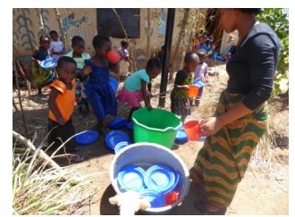
M'teza feeding programme