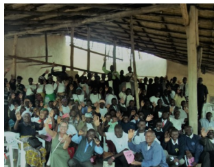
LBC Cluster Meeting