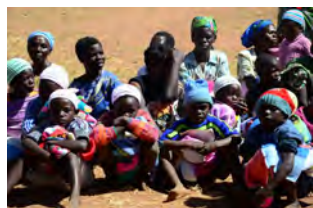
Colourful, warm orphans