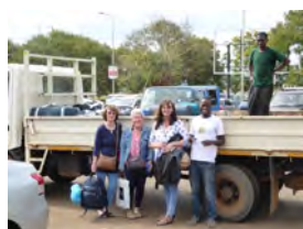
Arrival of 15 cases!