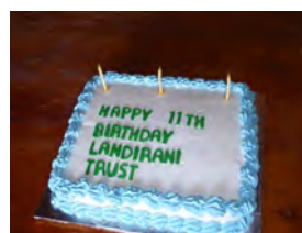
11 Year Celebration cake