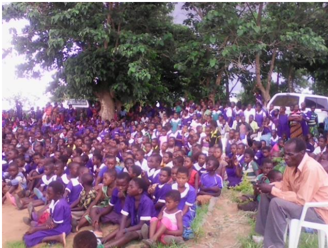
The students came all out