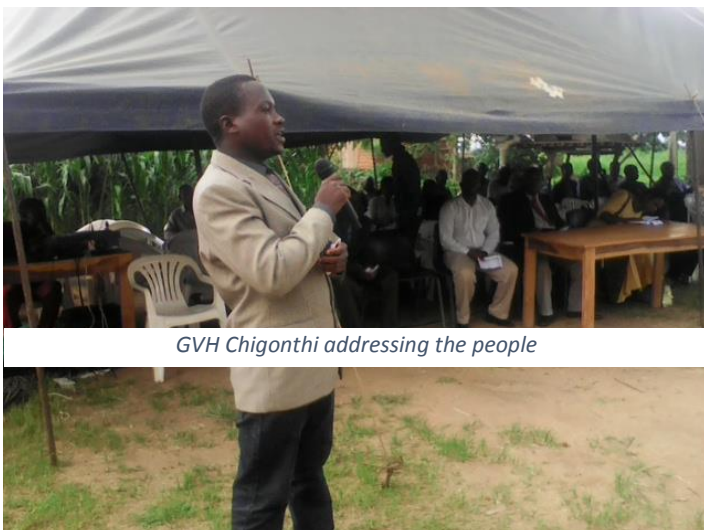
GVH Chigonhi addressing the people