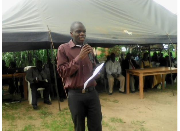
The M'teza Librarian briefing the gathering