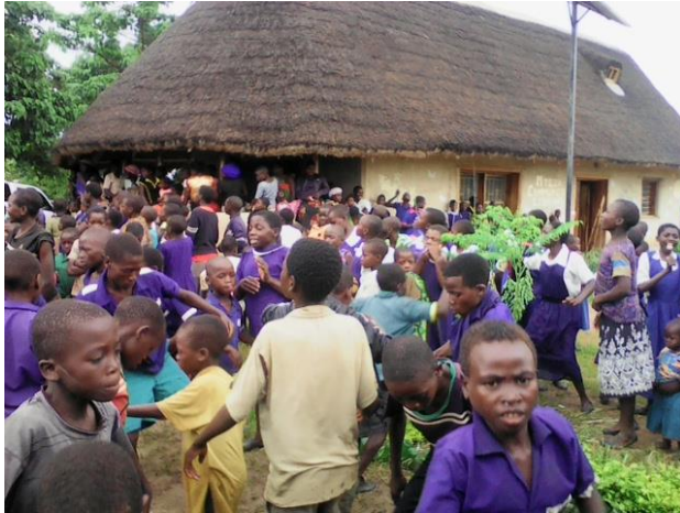
Young brains excited about the Library

The ceremony started at 2:00 p.m. with a tour of Sam's Village to make the guests appreciate the context in within which M'teza Library was built. Though very heavy rains poured half way through the function, the launch was still a success.