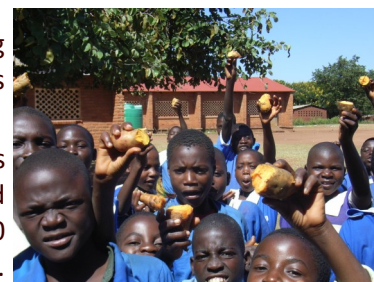
Children eating sweet potato

We've now done our selection process to select 10 orphan and vulnerable students out of the 90 who have applied. Next month we will hear if they have been awarded a scholarship to go to District or National Secondary School. We are looking for 10 sponsors to support them through their next 4 years of education at £18 a month. You can change someone's life for ever!