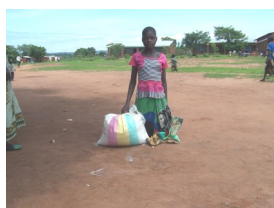
(left to right) 12 year old girl with sole responsibility for her siblings; grandmother left with 4 grandchildren; elderly lady with no family; distribution of food to the most vulnerable.