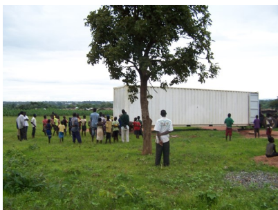
Excitement by the local village when the container arrived on site!