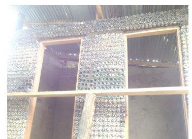
(above, left to right) roof of the new workshop; inside Trainee Accommodation; staff meeting in the Community Library; bottle wall compost toilet.