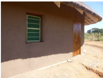
COMMUNAL STAFF HOUSE (ABOVE AND BELOW)