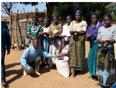
Women farmers in Chamcholo showing their shelled crop