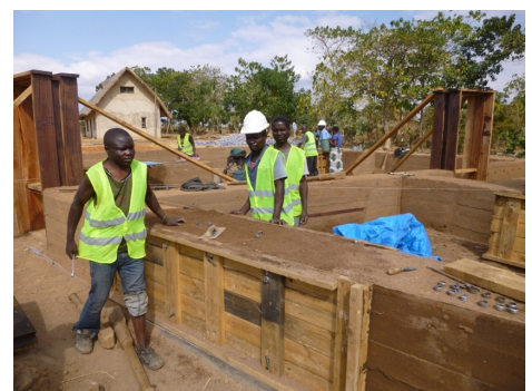
Foundations of Accommodation block below