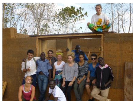
Tolworth Girls Secondary School