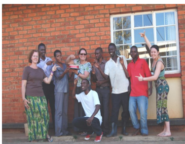
Happy 8th birthday!