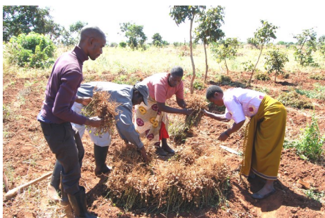
Blessings and Green helping some of the growers to harvest groundnuts

We have 14 centres. Our 100 women groundnut growers from 10 centres harvested their nuts in May. They are now stored until they are told NASFAM will come to buy them from them.