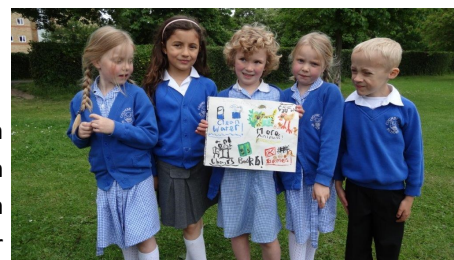
Coombe Infant pupils with their visions for their friends in Malawi.

We continue to operate under the name of The Landirani Trust in Malawi.