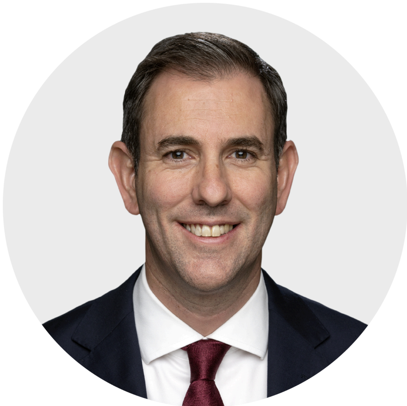
The Hon Dr Jim Chalmers MP Treasurer