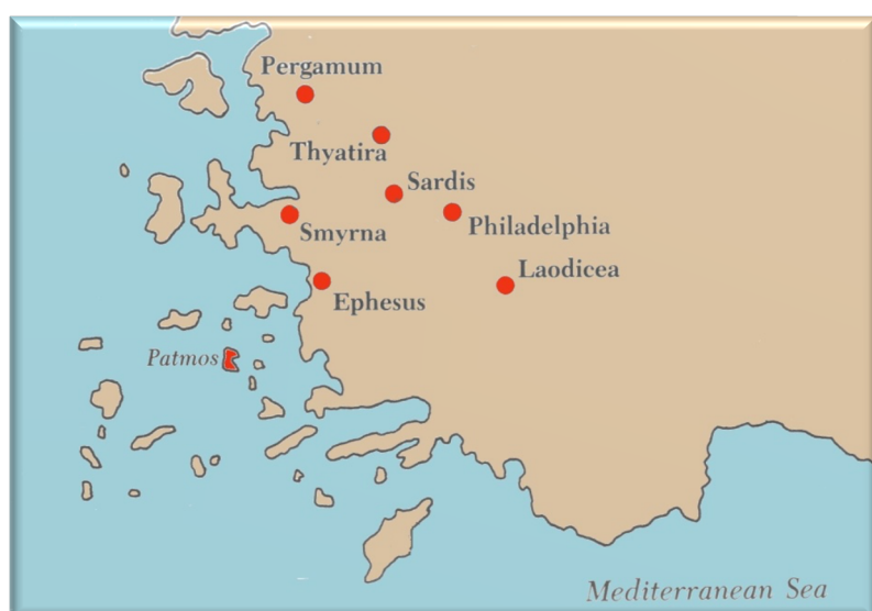
Seven Churches in Asia Minor

Adapted from page 1 of Apocalypse Now and Then by Paul Barnett (Aquila Press, 1989)