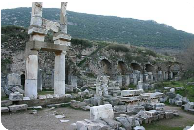
Temple for Dometian in Ephesus.

http://www.ephesus.us/ephesus/templeofdomitian.htm