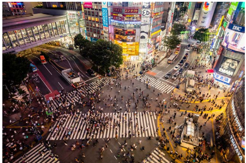
SHIBUYA CROSSING AT NIGHT

key. Street vendors, neon signs, and busy crowds are always ready to inspire your street photography. You'll also find lots of compelling architectural shots of futuristic buildings and their amazing designs. Shibuya is also known as a hotspot for fashion-forward people. Capture unique street fashion and edgy styles, showing off the area's latest trends and youthful spirit.