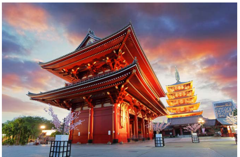
SENSO-JI AND ASAKUSA