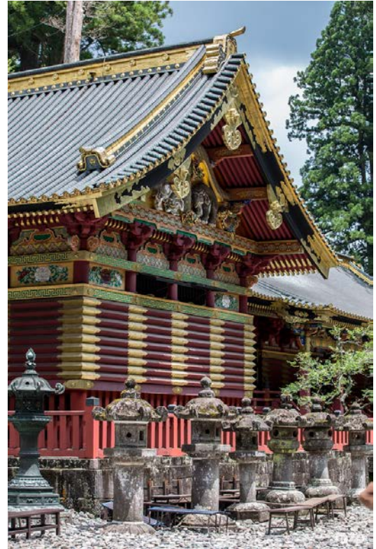
NIKKŌ TŌSHŌ-GŪ SHRINE

Together, these sites form the “Shrines and Temples of Nikkō” World Heritage Site, known for ornate carvings (like the Three Wise Monkeys and Sleeping Cat) and richly colored architecture.