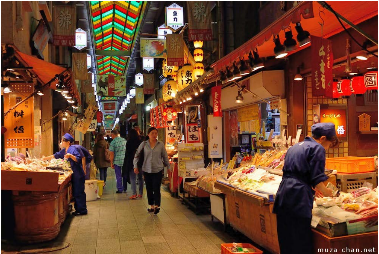
KYOTO NISHIKI FOOD MARKET

packing for home. As a special bonus, we will enjoy a ceremonial Japanese tea service today before we say farewell to Japan.