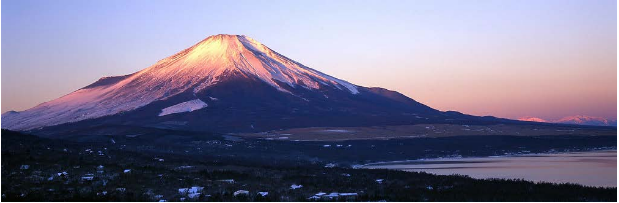
MT. FUJI & LAKE YAMANAKA

Private transportation and English-speaking guide