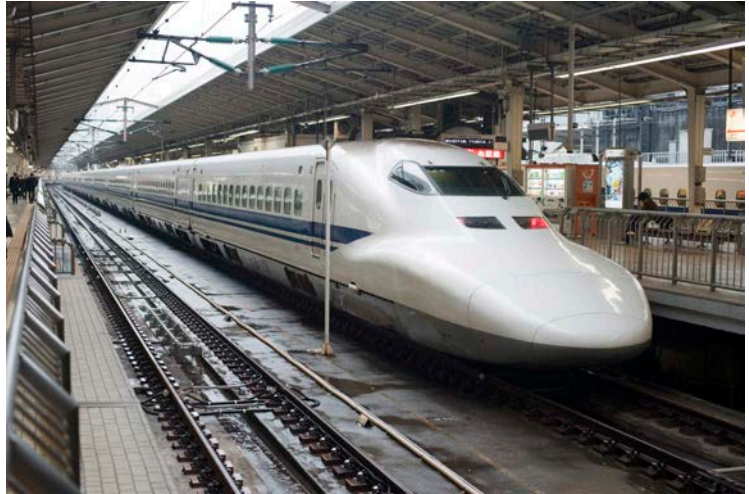
SHINKANSEN (BULLET TRAIN)

The rest of the day is yours to enjoy independently, or just to relax.